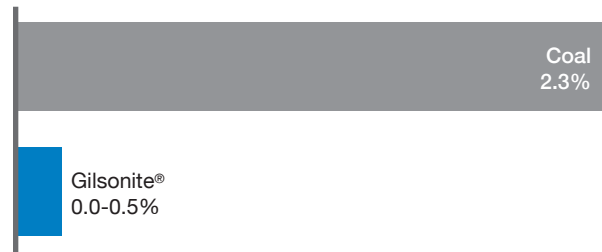
Similar results were obtained with different temperatures and slurry densities.